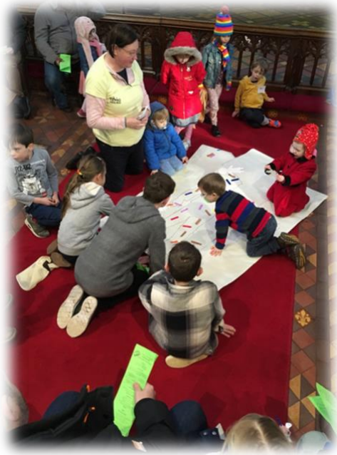
All Age Climate Service "Water of Life" August 2022

We have a contemplative Silent Prayer group which has run since 2011, meeting once a week. This at one time was affiliated to the Julian Meetings but stopped during the first year of lockdown. Since January 2021 there has been a weekly Zoom Silent Prayer session which continues with between 2-6 people.